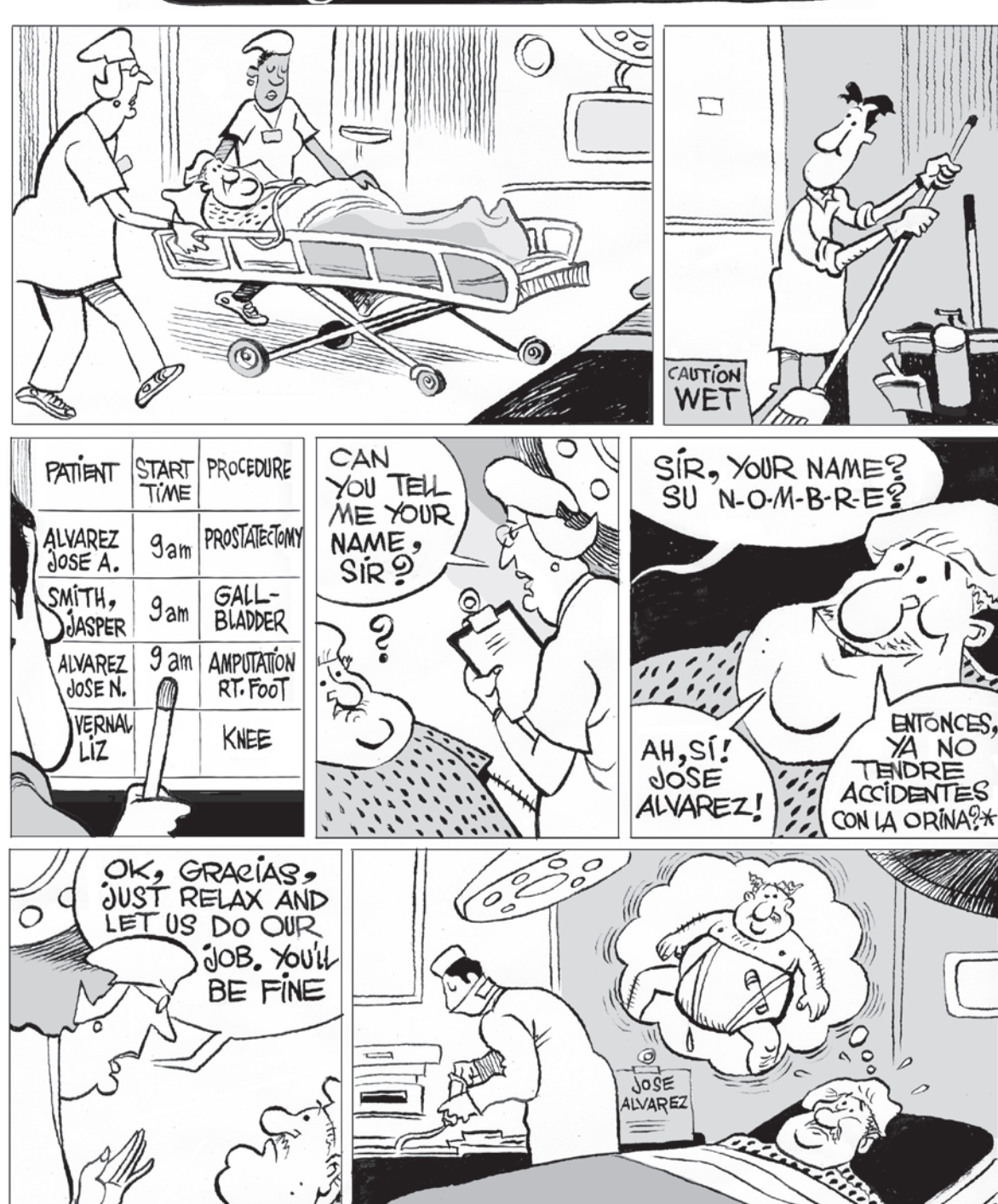
*50, NO MORE PROBLEMS URINATING?